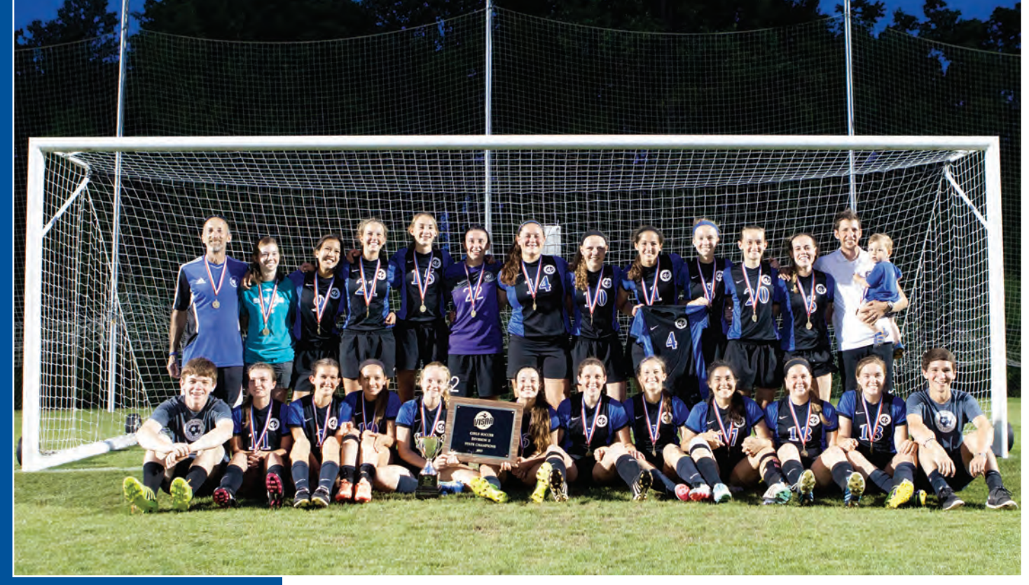
Congratulations to Girls Varsity Soccer - 2015 VISAA Division II State Champions! Stay up to date and cheer on the Flames by checking www.easternmennoniteschool.org.

Eastern Mennonite School joins home and church in calling students to faith in Jesus Christ, academic excellence, personal integrity, and compassionate service in the world.