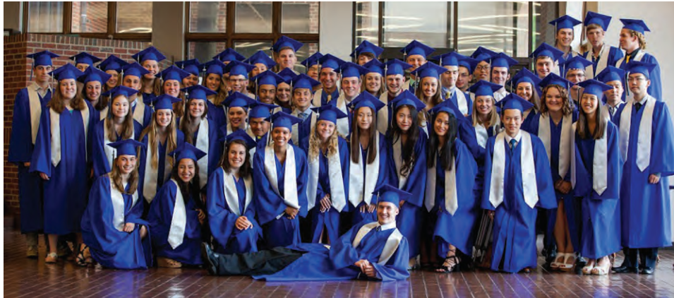
The Class of 2016 takes a moment for one last group photo prior to the 98th Commencement ceremony of Eastern Mennonite School.

Congratulations Class of 2016 on all your accomplishments! We will miss you greatly at EMS but look forward to seeing you apply your gifts and knowledge in our local and global communities!