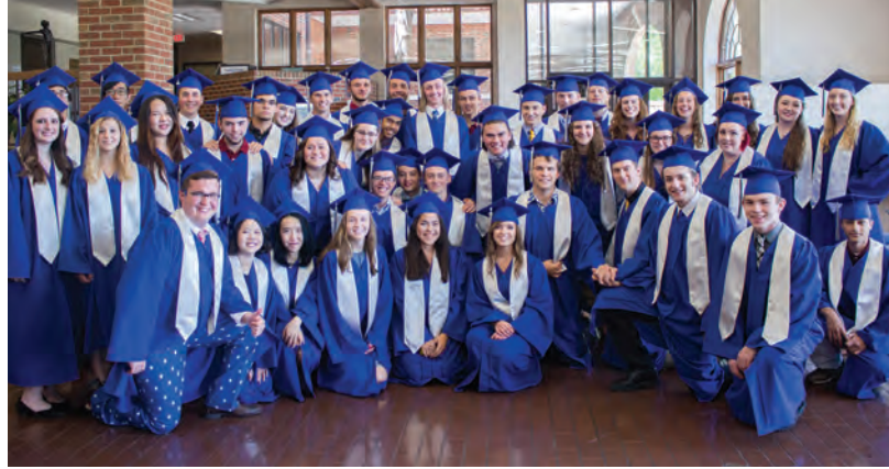
Left: We will miss the Class of 2017!

Below: EMS Faculty and staff continue their time-honored tradition of applauding for newly-minted graduates as they leave the ceremony.