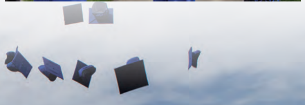
Below: The Class of 2017 celebrates at the end of Commencement.