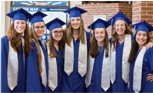
Left: Life-long friendships are a cherished part of the EMS experience!

We wish each student God's blessing as they depart for the next phase of their journey! For more information on joining the K-12 EMS community, contact (540) 236-6021 or admissions@emhs.net .