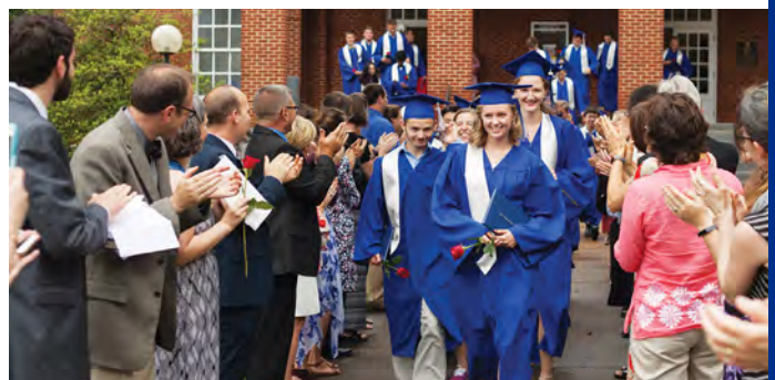
Teachers – lifelong mentors and cheerleaders – line the walkway to celebrate the class of 2018 following commencement.

would serve the Lord with all their hearts. In their class Scripture, they affirmed that all things work together for good for those who love God, who are called according to his purpose (Romans 8:28).