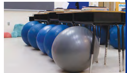
Jodi Beachy’s fifth grade classroom is ready for action! EMES uses chairs and tables of varied heights and yoga balls for seats to support the active bodies that come with active minds.