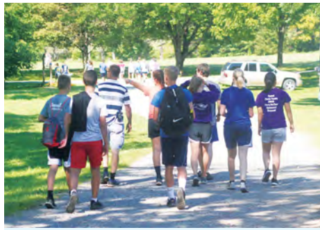
School day out at Highland Retreat is a long-time tradition at EMHS. The sun shone on this year's time of community building and fun.

During our first K-12 convocation, each student received a tile/stone/button to symbolize how each person contributes to the whole. During the service, students and staff put their unique piece in a jar to create one beautiful piece. Readers from each division shared Scripture and we learned American Sign Language to “Jesus Loves Me.”