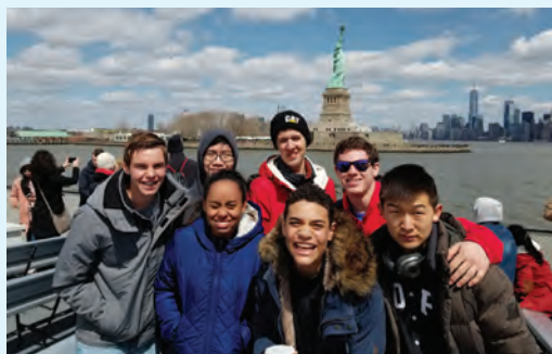
New York City E-Termers explored life in the Big Apple, including a chilly harbor ride.

Working, learning, and in some cases, living side by side one another during Explore Week and E-Term are powerful opportunities for EMS students and faculty to bond over a common goal, challenge themselves with new experiences, and become engaged in learning in new and unique ways. Please take a moment to peruse the breadth of opportunity in our Experiential Learning program through this issue, or better yet - ask an EMS student in person what they’ve learned by doing and trying.