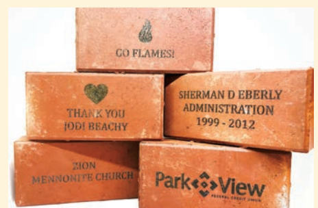
Jessica Peachey of Blue Ridge Engraving

We have raised more than $30,000 toward our $50,000 goal to build a bridge between our two buildings. Thank you parents, class of '19 and other supporters! The bridge will provide safe pick up and drop off space for elementary students and a covered outdoor learning space. Engraved bricks honor students, alumni, teachers, past and present administrators, and recognize businesses. May 31 deadline extended for Today readers! Order online at easternmennonite.org/support/build-a-bridge