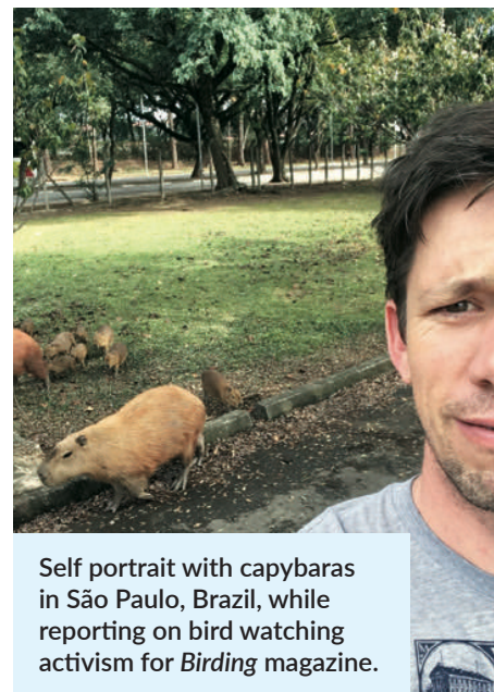
Self portrait with capybaras in São Paulo, Brazil, while reporting on bird watching activism for Birding magazine.

The experience "probably made me more comfortable than I would have been otherwise, being in situations where I'm different than everyone else, or in being in unfamiliar places," he says. "It also gave me a perspective on material comforts that manifests itself nowadays in me lecturing my kids about how they have no idea how lucky they are."