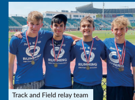
Track and Field relay team