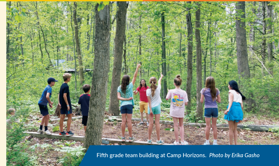
Fifth grade team building at Camp Horizons.