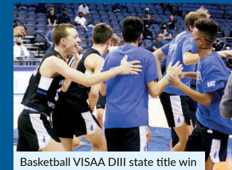
Basketball VISAA DIII state title win