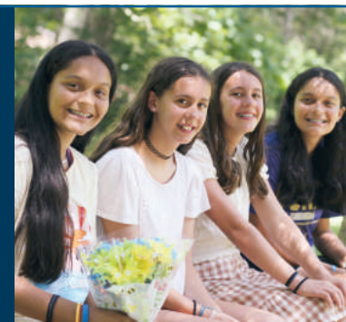
Eighth grade graduation