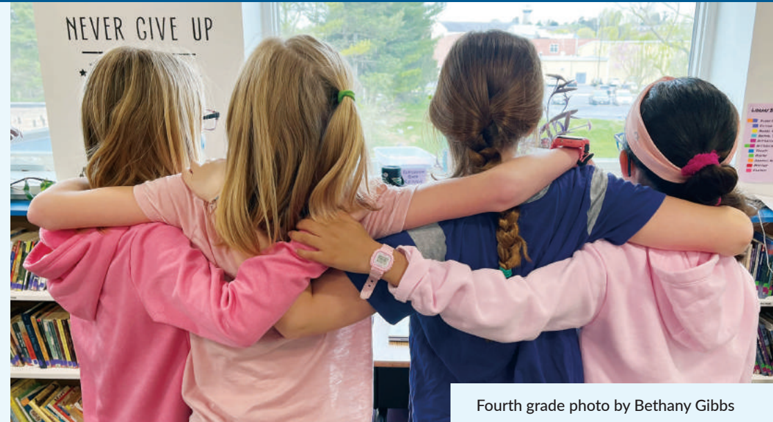
Fourth grade

Eastern Mennonite Elementary School was founded in 2005 with an RJ lens woven into the fabric of this new school culture. That mindset has gained momentum in our school, spreading into the “DNA” of our middle and high school. Currently, restorative practices are gaining momentum not only at EMS, but in schools nationwide.