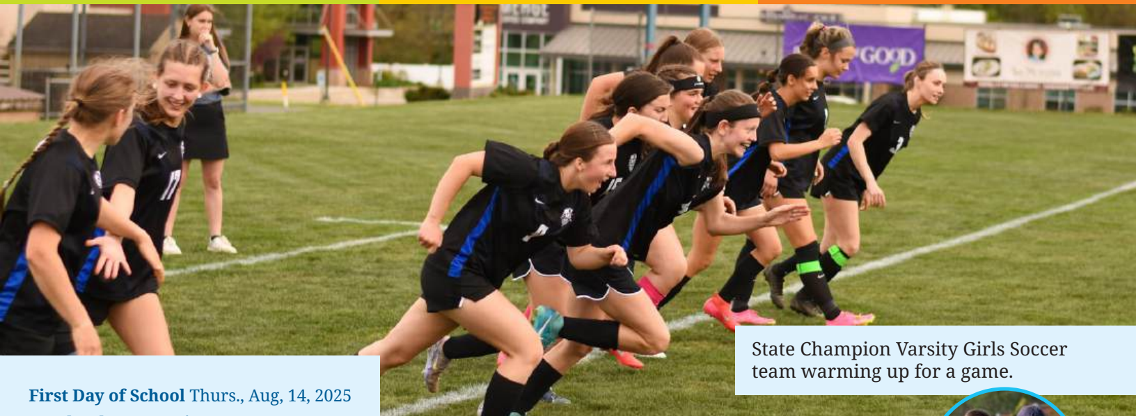
State Champion Varsity Girls Soccer team warming up for a game.

First Day of School Thurs., Aug. 14, 2025 Fan the Flames Auction Sat., Sept. 13, 2025 Homecoming October 17-18, 2025