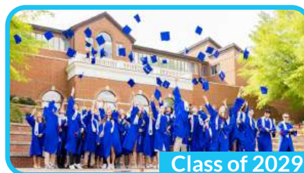
Class of 2029

awe. “You have everything you need to be successful.” She urged graduates to approach life as they do experiential learning trips EMS is known for, asking, “What if all this learning is actually the recipe for building a fulfilling life?”