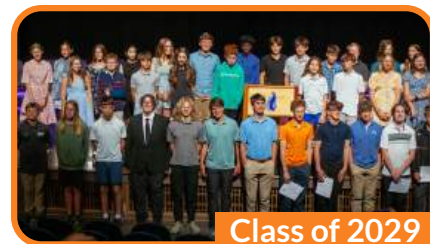
Class of 2029

The highlight was the presentation of certificates, each paired with affirmations crafted by the teachers to honor the uniqueness of every student.