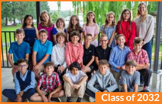
Class of 2032